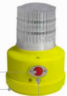
LED indicator – tells you when charge is getting low