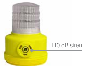
110 dB siren