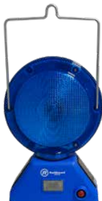
M900-SB (Blue) With handle