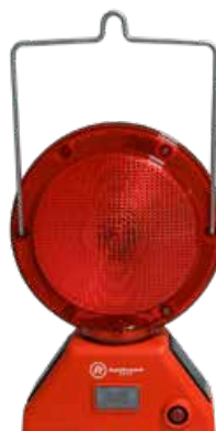
M900-SR (Red) With handle