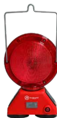
M900-SR-2M (Red) With handle & magnets