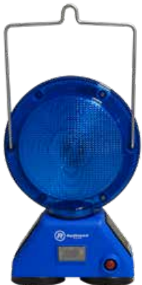
M900-SB-2M (Blue) With handle & magnets