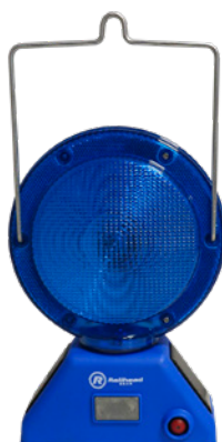
M900-SB (Blue) With handle

Meets ITE Requirements & NCHRP-350 Certification