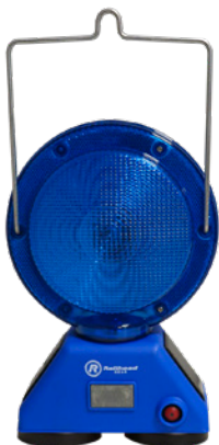
M900-SB-2M (Blue) With handle & magnets