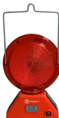
M900-SR (Red) With handle