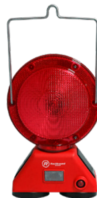
M900-SR-2M (Red) With handle & magnets