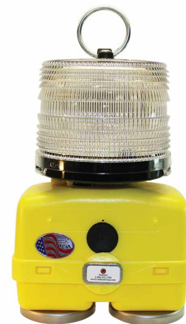
SL-1000-M *2-90 lb. pull magnets included