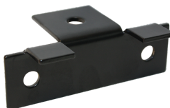
Drill-free mounting bracket included