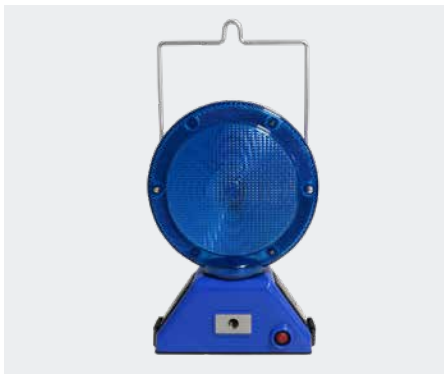
M900-SB (Blue) With handle