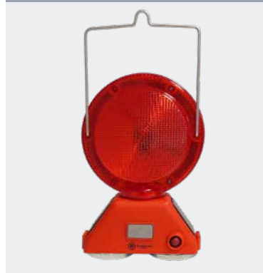
M900-SR-2M (Red) With handle & magnets