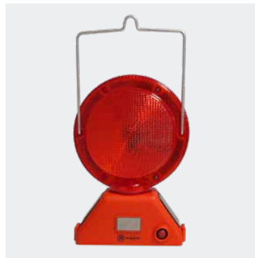
M900-SR (Red) With handle