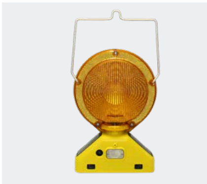
M900-SA (Amber) With handle

Meets ITE Requirements & NCHRP- 350 Certification