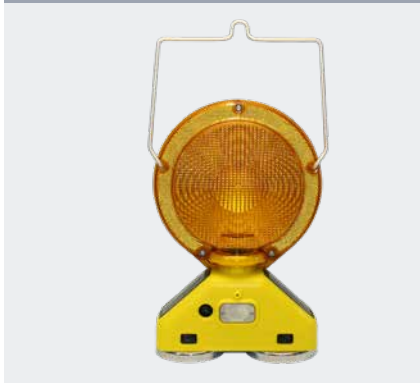
M900-SA-2M (Amber) With handle & magnets