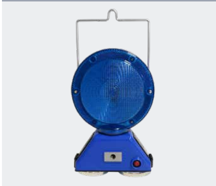
M900-SB-2M (Blue) With handle & magnets