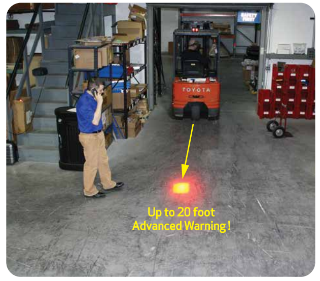
The Safe Spot has two LED lights and lenses to ensure a visible red spot on the floor and an excellent heat sinkdesign to ensure long LED life.

The KE-LTRL-2 meets UL approvals UL558 and UL583.